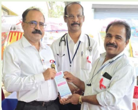
AIDS awareness Pamphlets distributed at General hospital Kasaragod