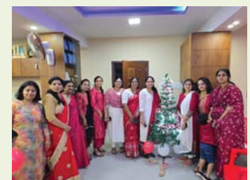
Family meet of Rotary club Kasaragod held on 24-12-24 8 Pm Rotary Bhavan Kasaragod