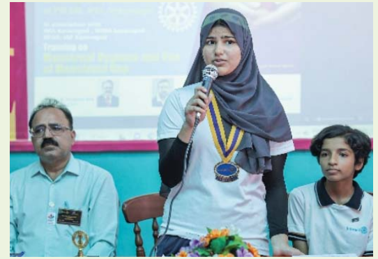
Interact Meeting at KV 2 Kasaragod