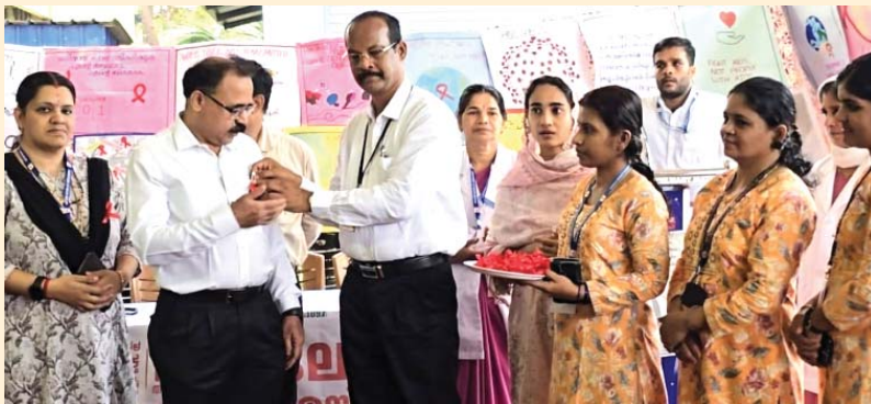
Rotary club Kasaragod in Association with ART center Kasaragod, GH Kasaragod, IMA, IAP conducted Red ribbon wearing Awareness Programme as part of World AIDS day Celebration