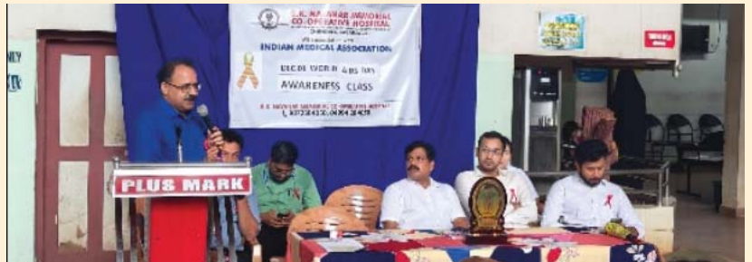
RC g Kasaragod in Association with EK Nayanar Memorial Co Operative Hospital Chengala Conducted World AIDS day Awareness class at Chengala Hospital