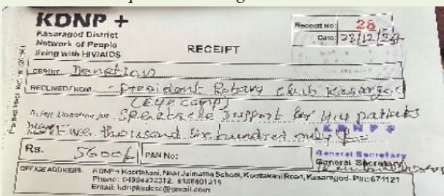
Rotary club Kasaragod gave financial support to Kasaragod District Network of people living with AIDS Spectacle support to 16 many members Contributed Programme of District Priority Gift of Sight