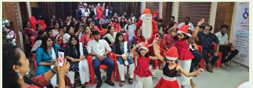
Christmas Celebrations Held at Rotary Bhavan Kasaragod There was Christmas carol, variety Entertainment