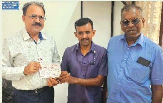
Donated a sum of Rs 5000 to the State Conference of Kerala Federation of the blind thiruvananthapuram